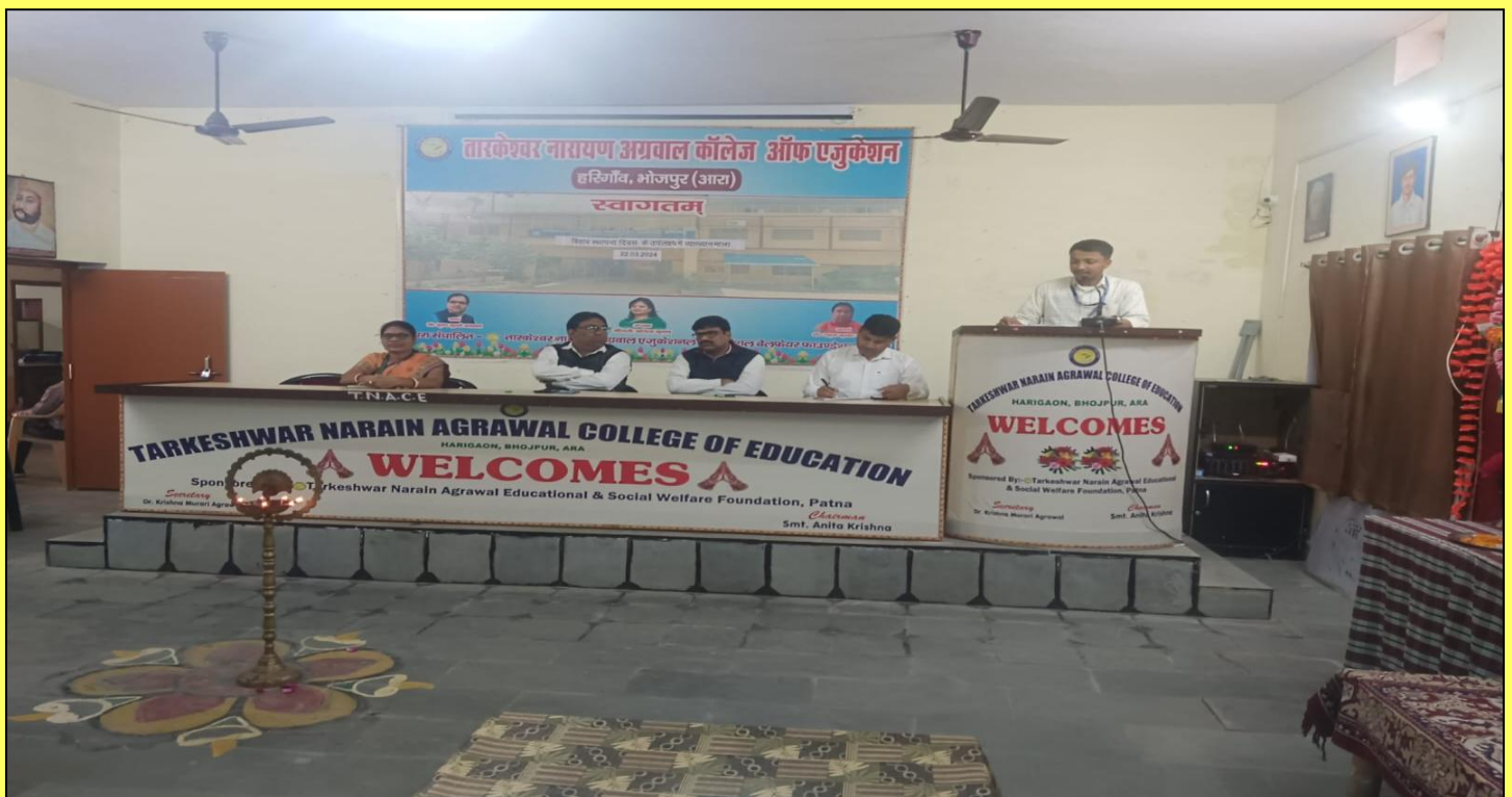
Speech by Student – Teacher on Bihar divas