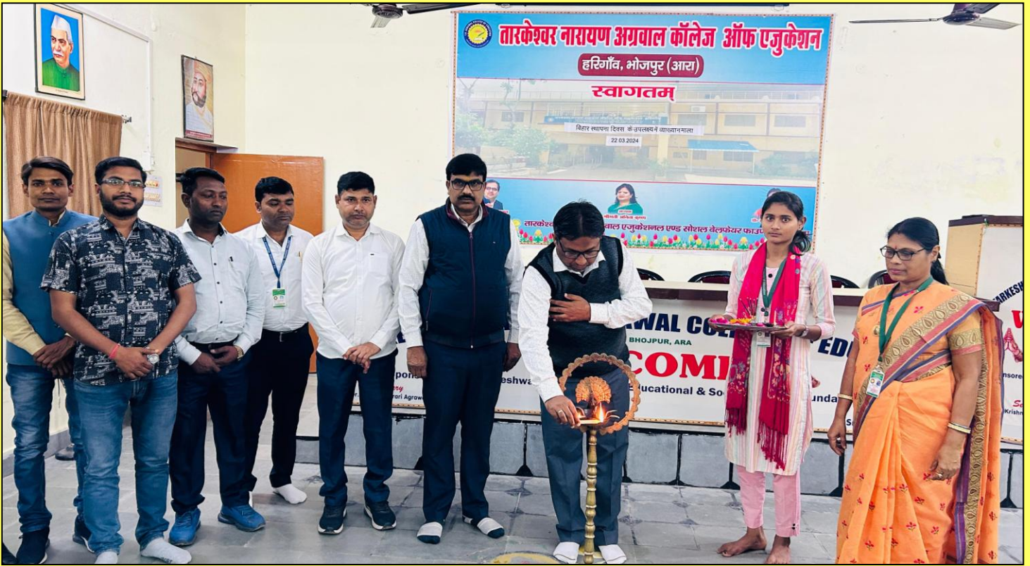
Lamp Lighting by Principal Sir & Faculty