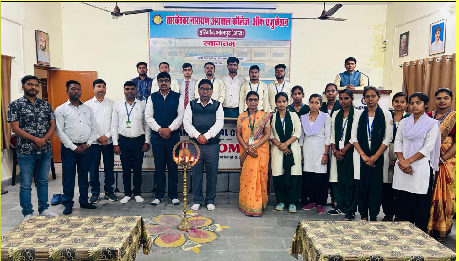
Group Photo on Bihar divas