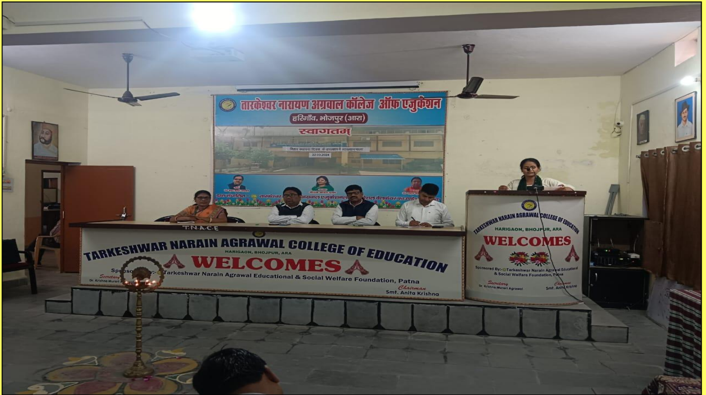
Speech by Student – Teacher on Bihar divas