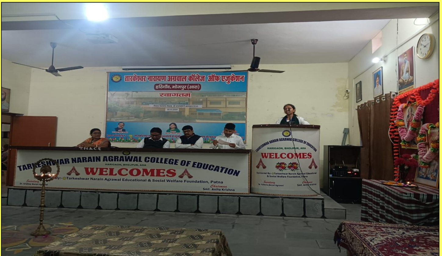
Speech by Student – Teacher on Bihar divas