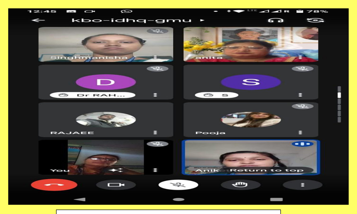
Students with online on IWD 2024