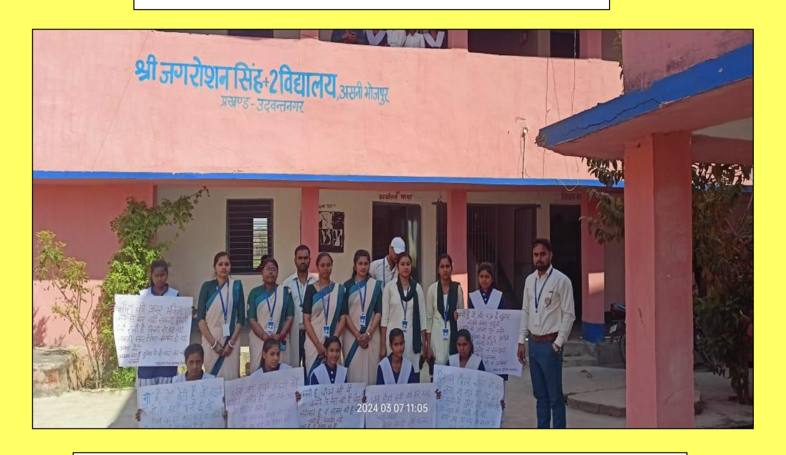
IWD Poster by trainees of TNACE with online during their internship