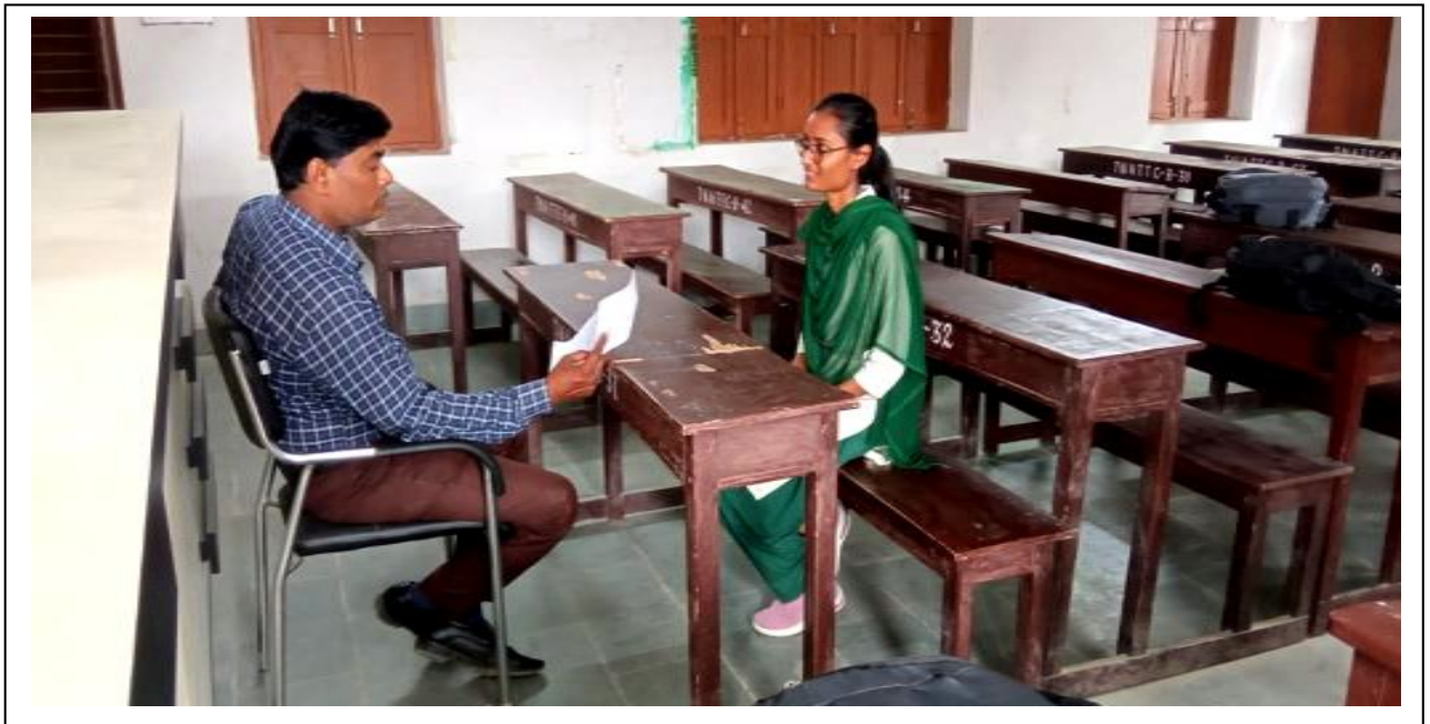
AS FOR SLOW LEARNER NEED, 02/08/2021