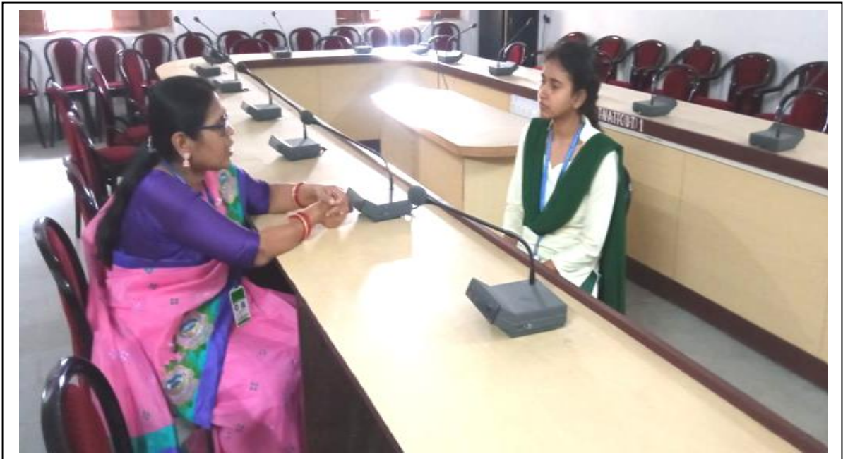
AS FOR SLOW LEARNER NEED, 15/11/2022