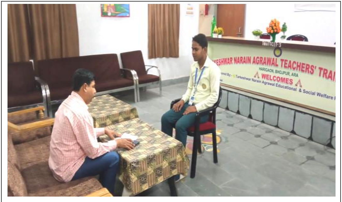
AS FOR STUDENT NEED, DATE: 02/08/2021