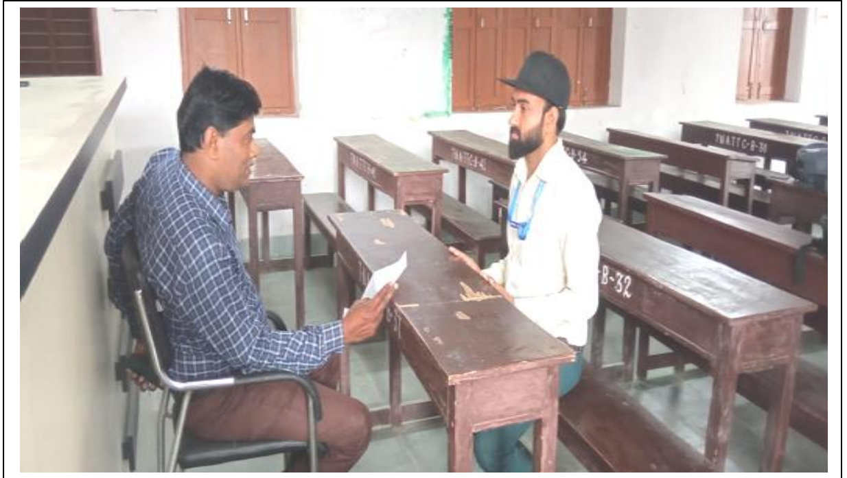
AS FOR STUDENT NEED, 02/08/2021