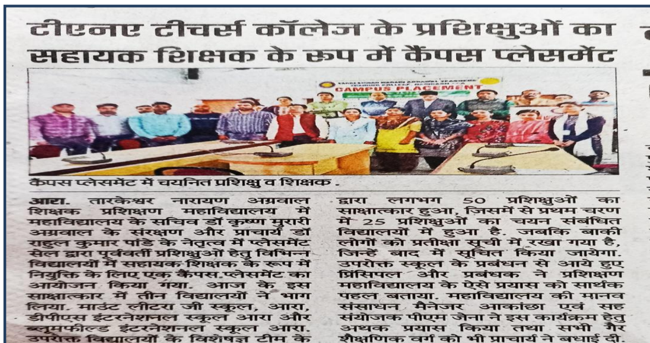
News on Paper regarding Placement Interview on 18 th Nov. 2022