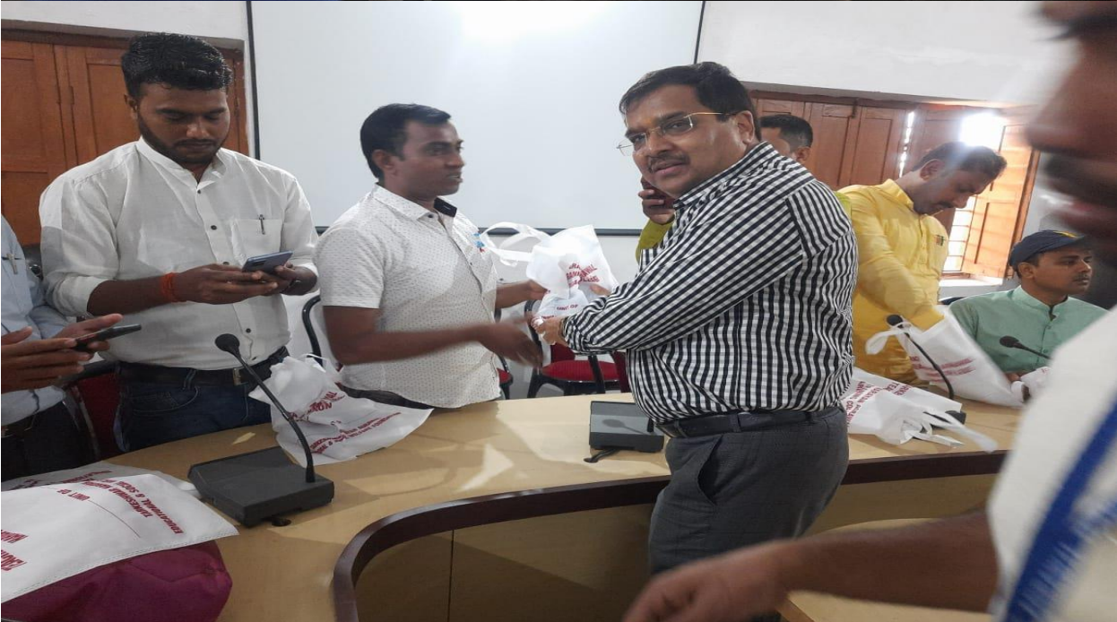
ALUMNI felicitation by Patron & Principal of TNATTC