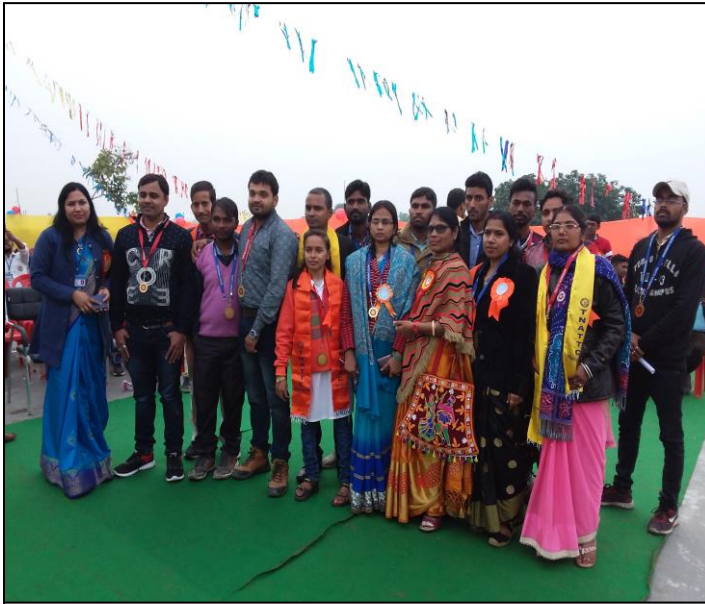
Alumni of Session -2010-11