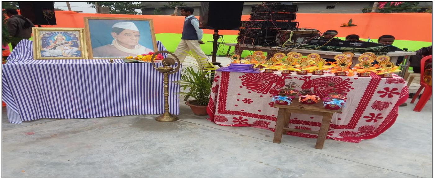
Venue of ALUMNI meet (Roof of "A" block, TNATTC,