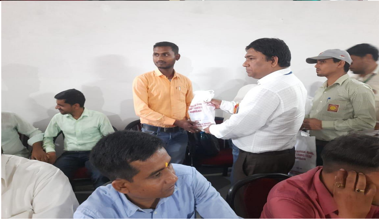
Assembled ALUMNI at Conference Hall of TNATTC