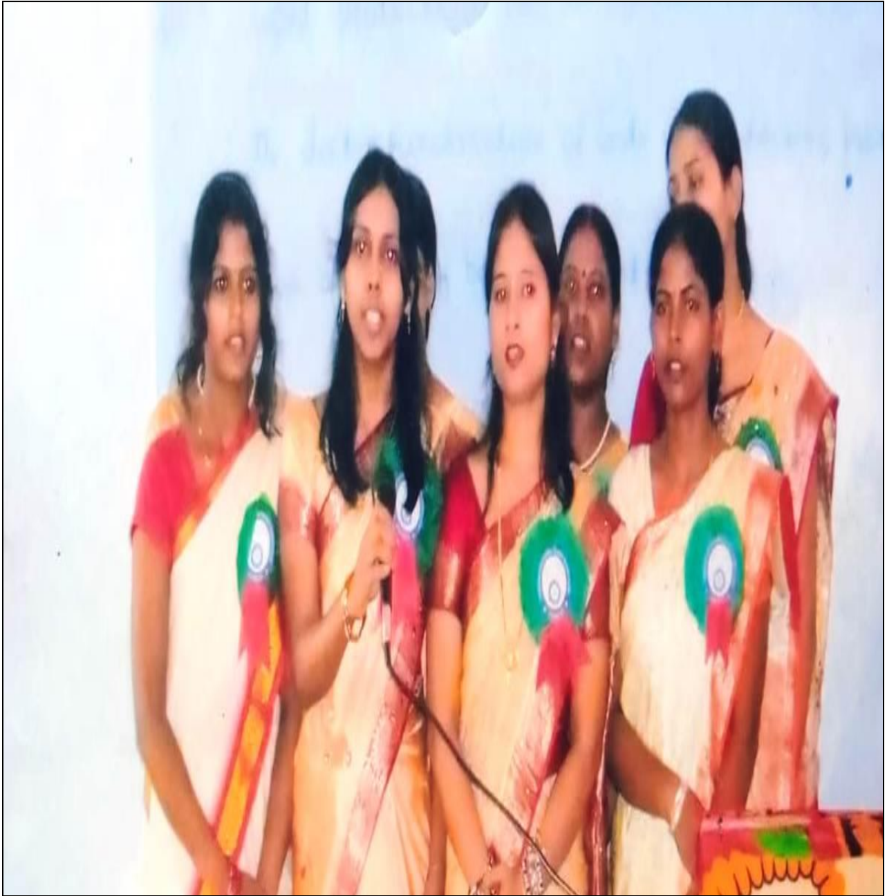
Welcome Song by Students