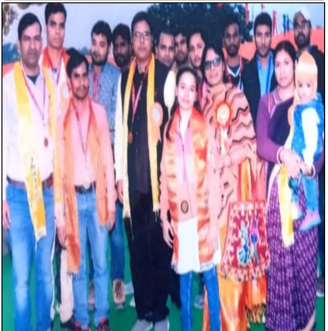
Group of Alumni with Faculty