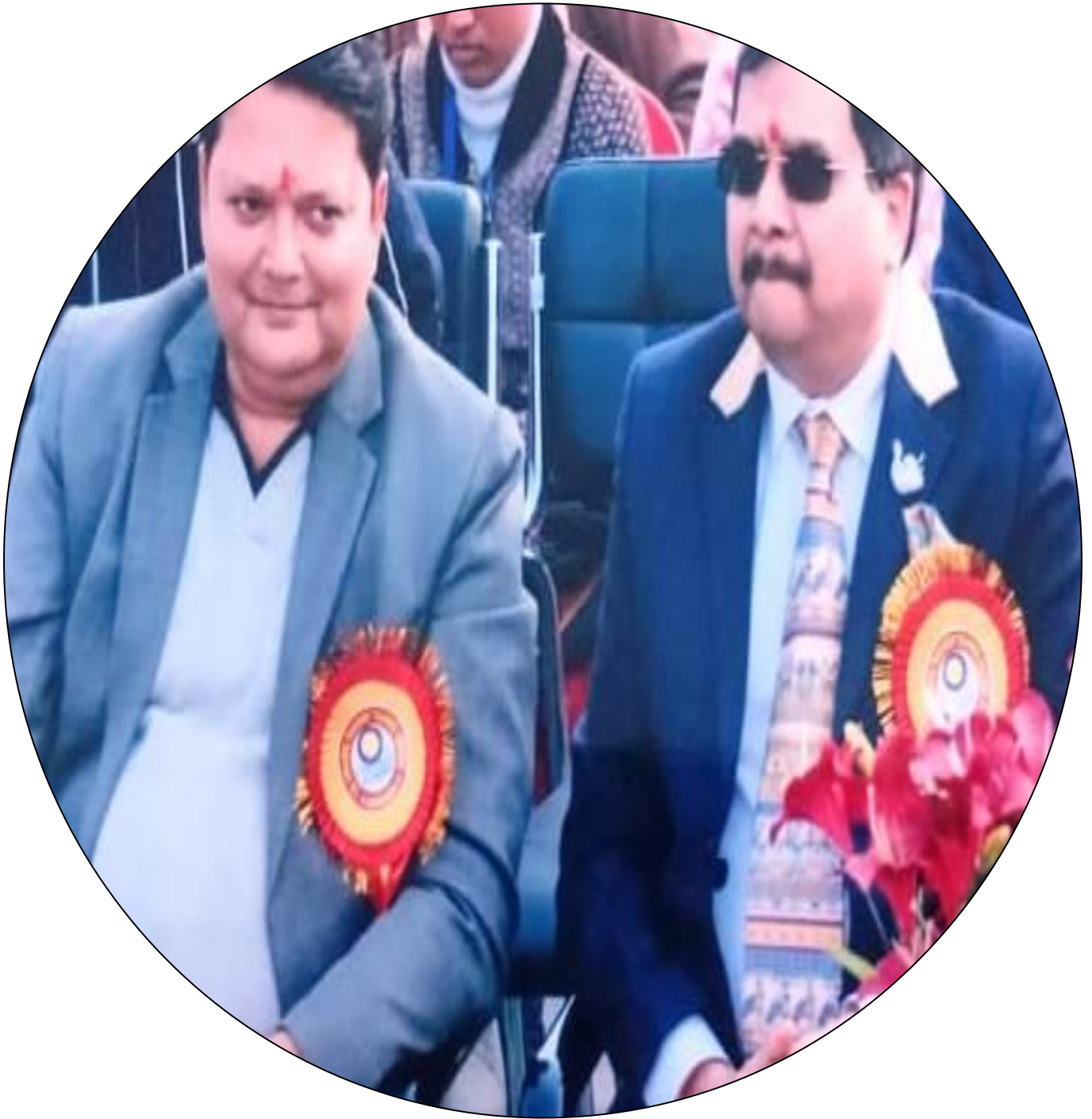
Chief Guest & Secretary Sir Enjoying the Programme