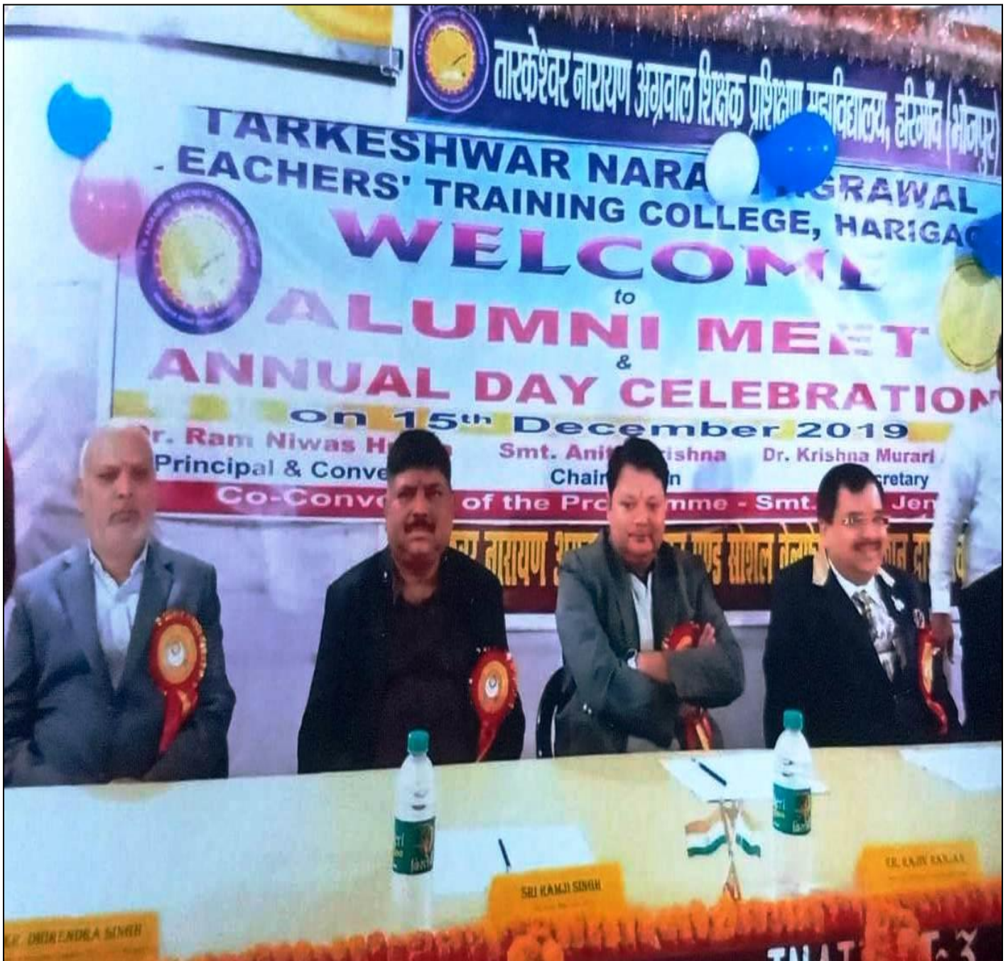
The Guests OF ALUMNI meet