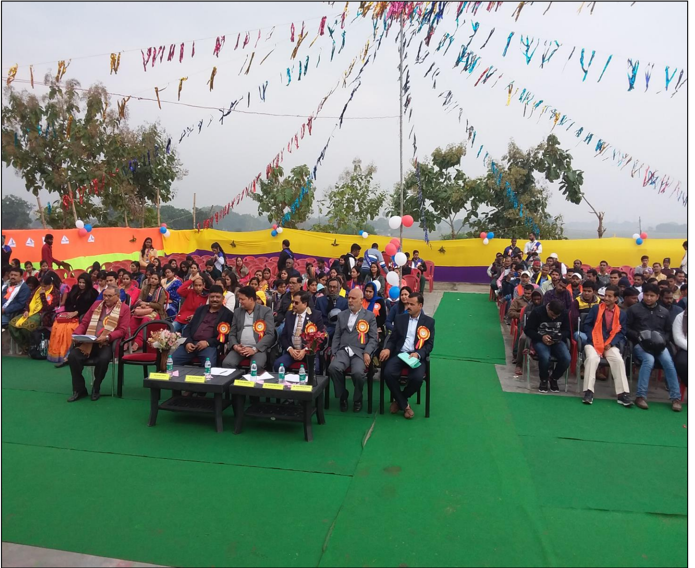
Program at roof of “A” Block