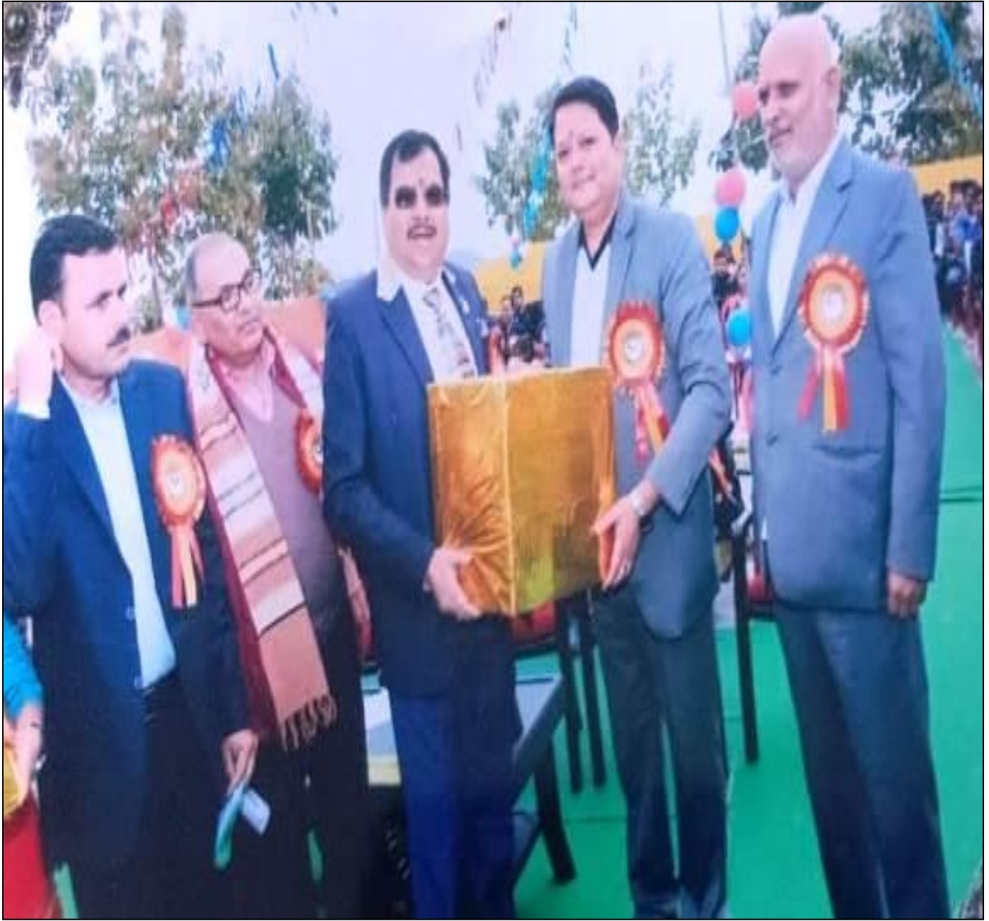
Honored by Memento to Chief Guest