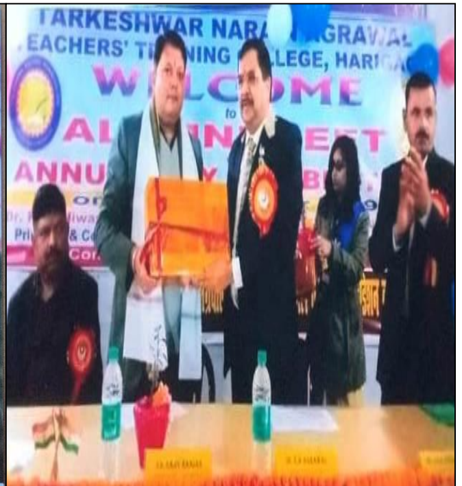
Honored by Memento to the Chief Guest & Chief Speaker