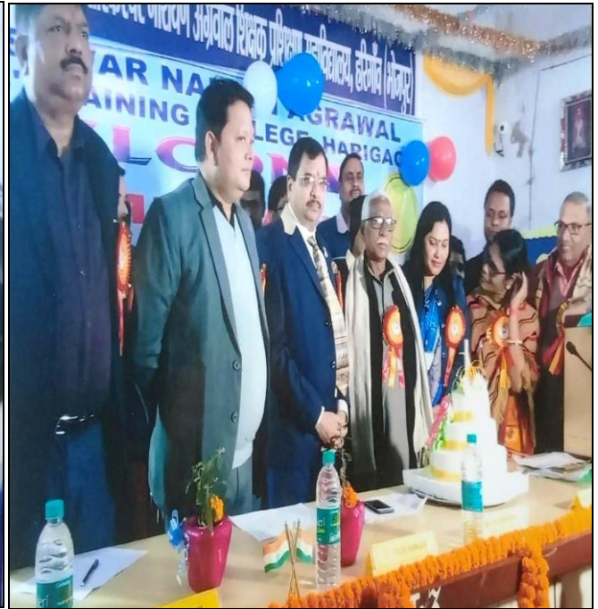
Birthday Celebration of Honorable Secretary Sir