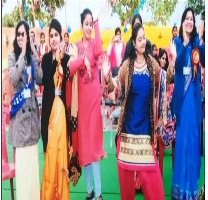
Cheerful moments of our Alumni