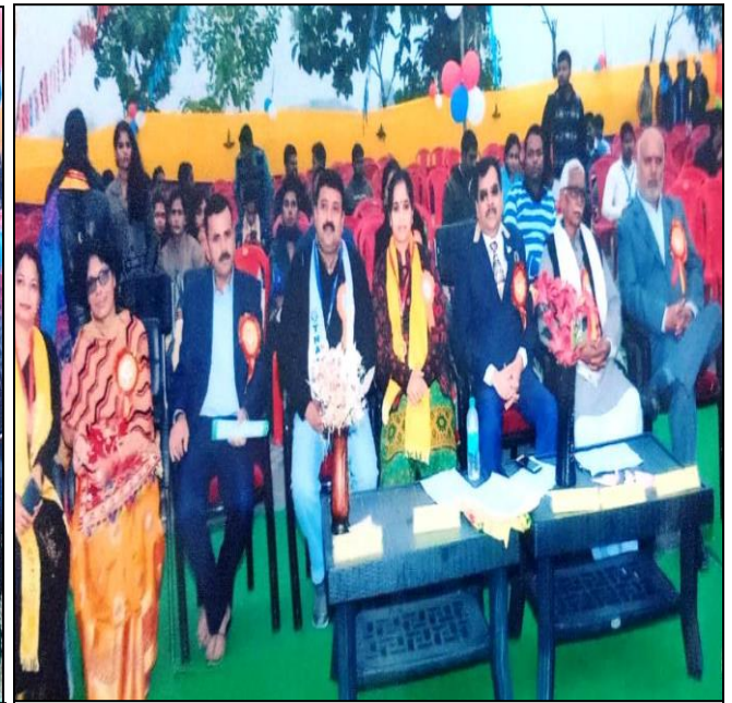
Alumni of Session 2014-15