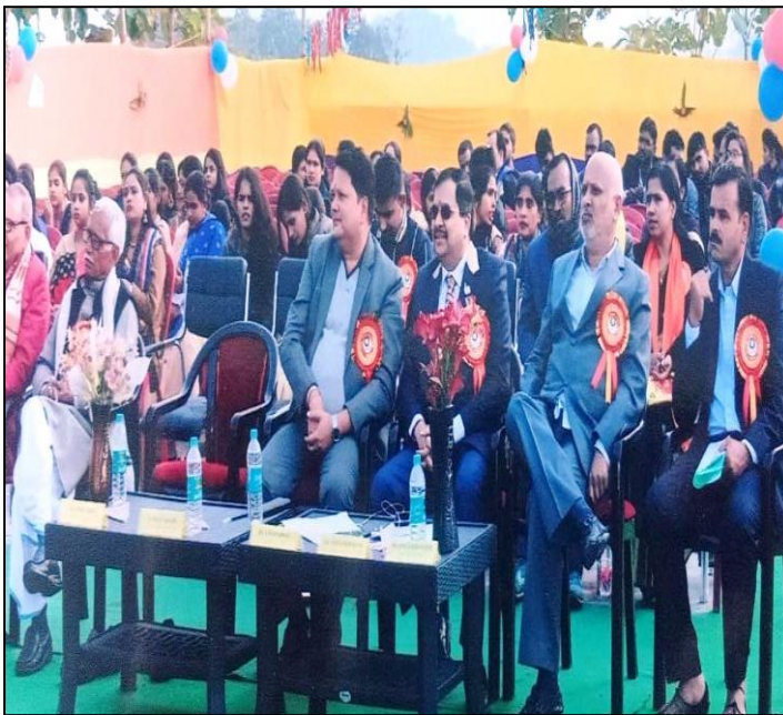
Alumni of Session 2013-14