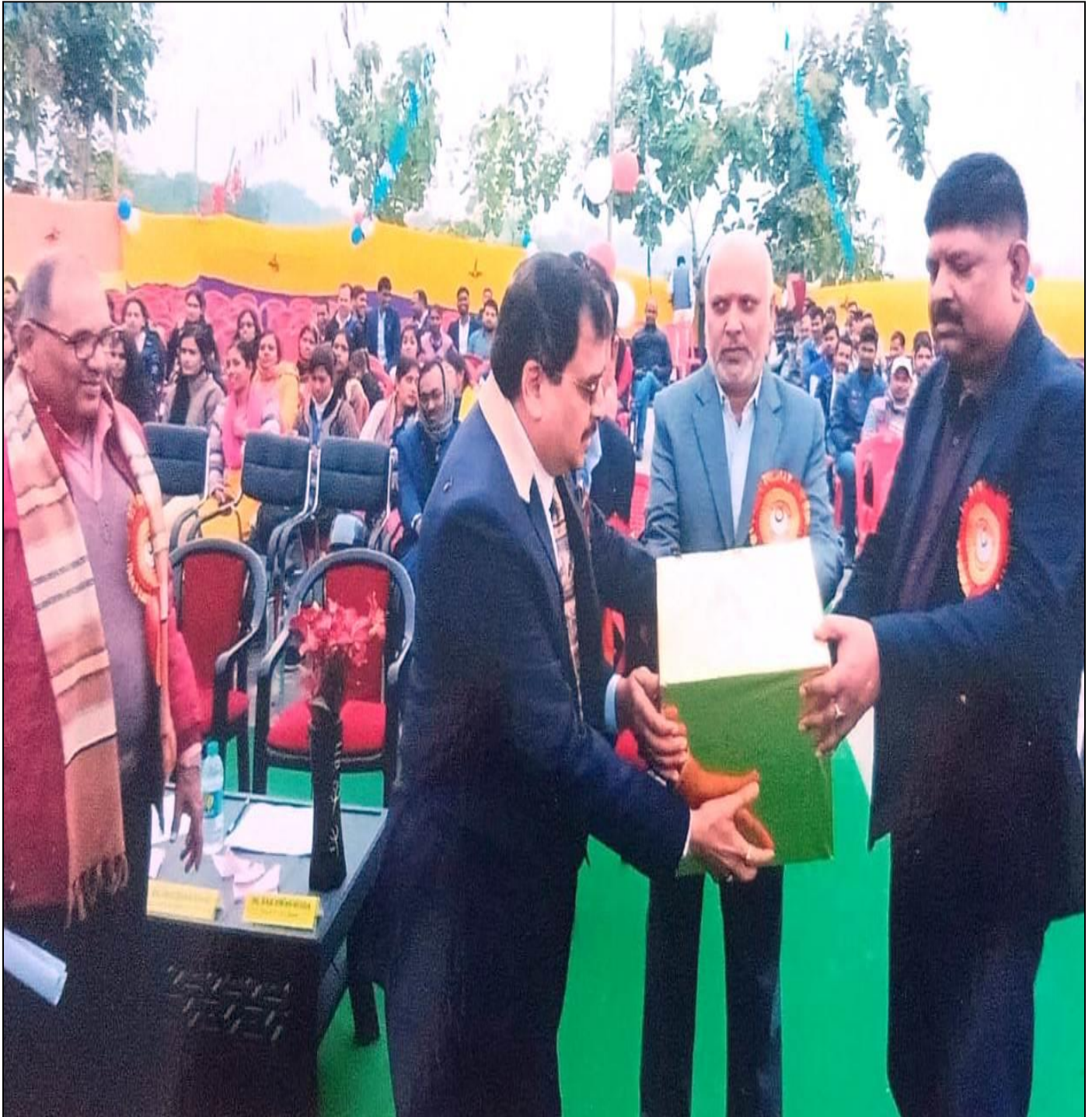
Honored by Memento to Chief Speaker