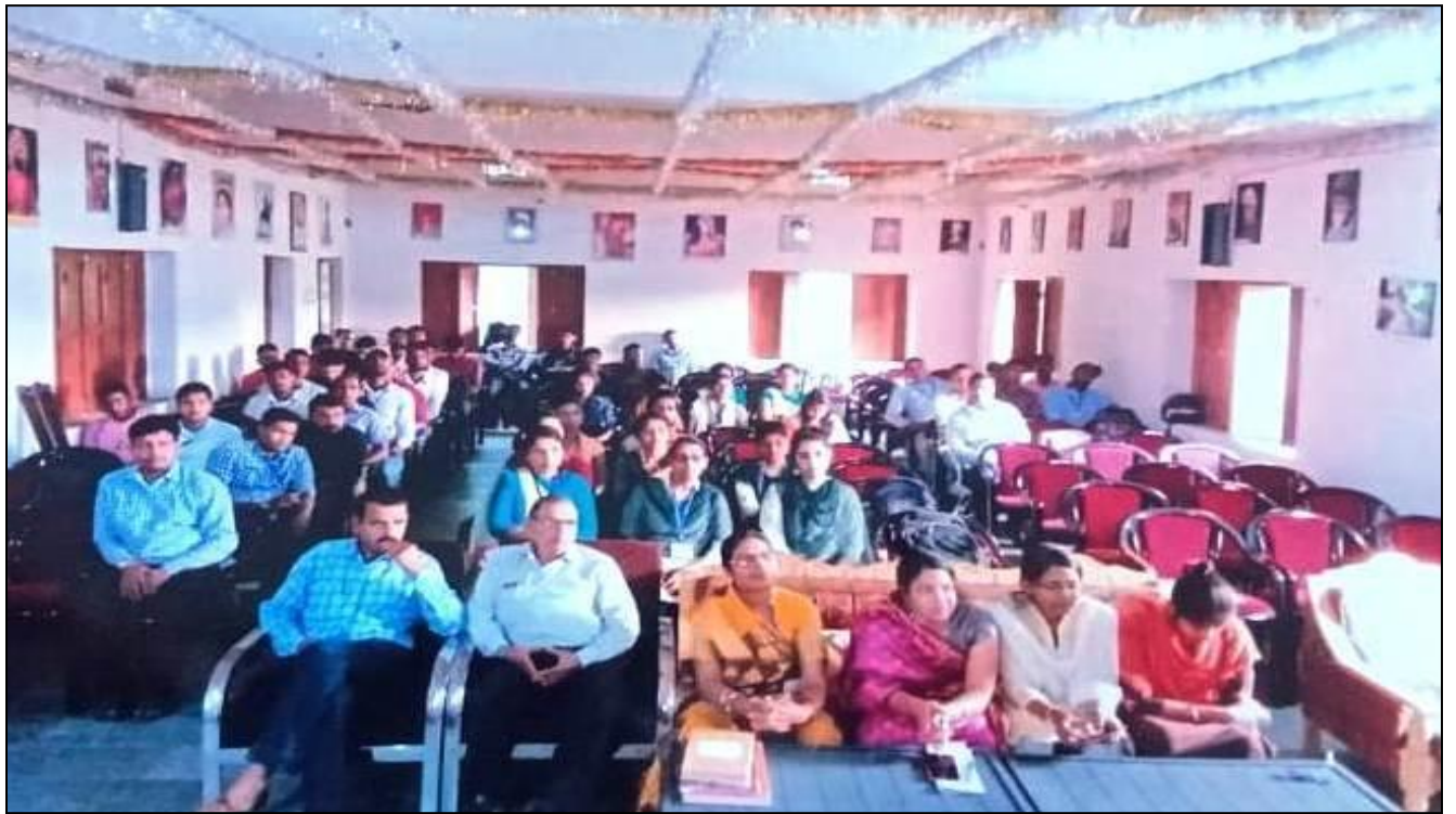
Alumni at the Program Spot