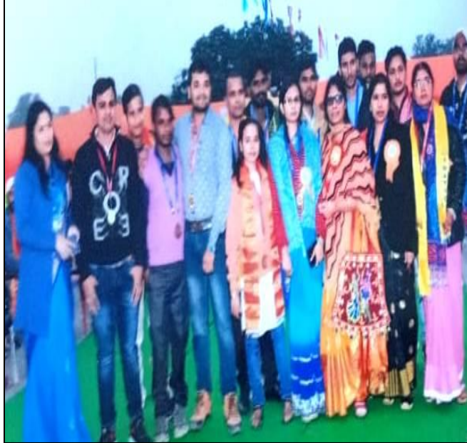
Group of Alumni with Secretary Sir, Managing Committee & Faculty