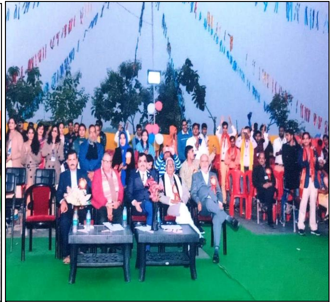
Alumni of Session -2011-12