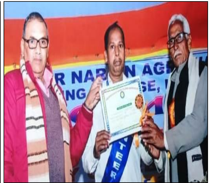
Certificates for the best Performer