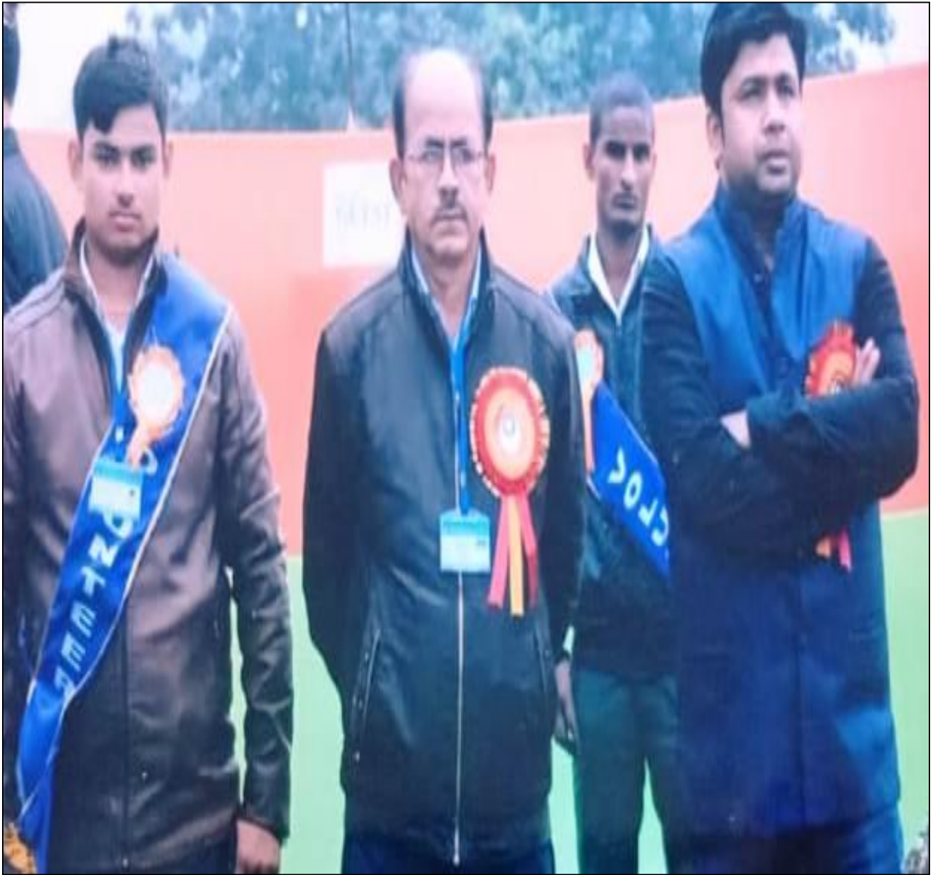
Alumni with Volunteers