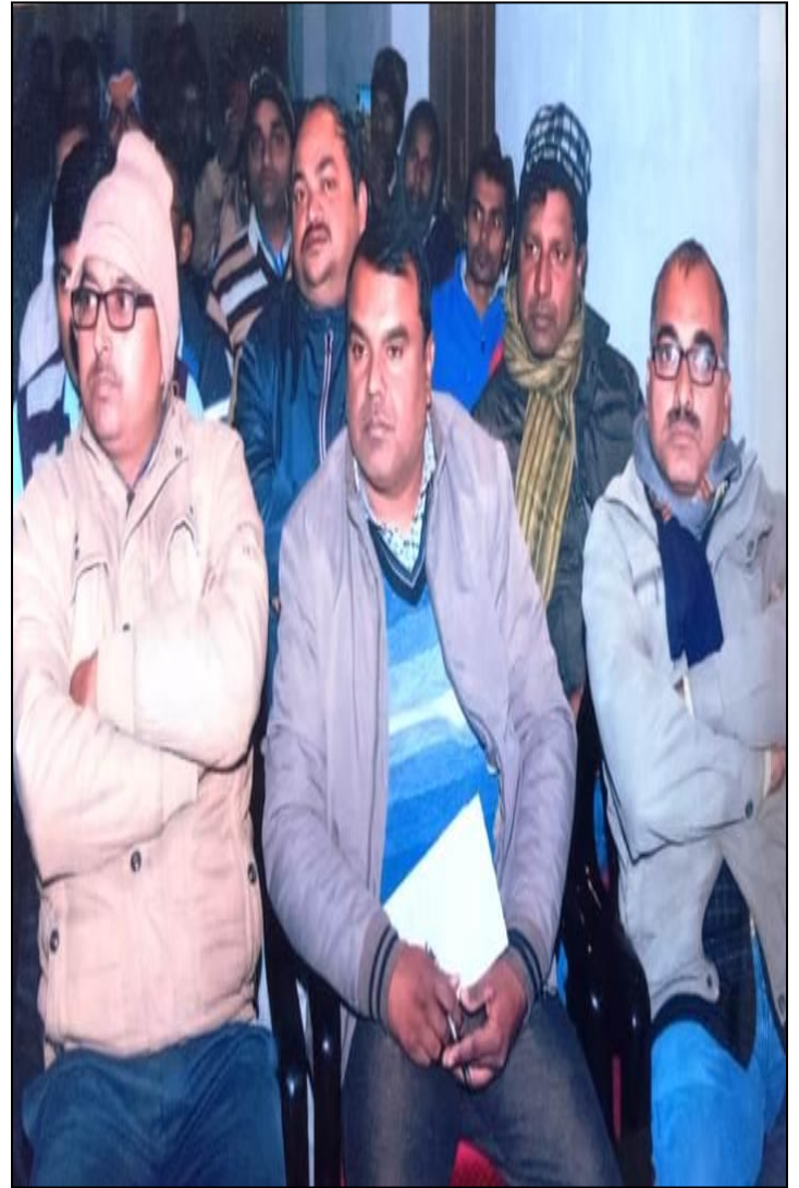
Alumnus at Program Place