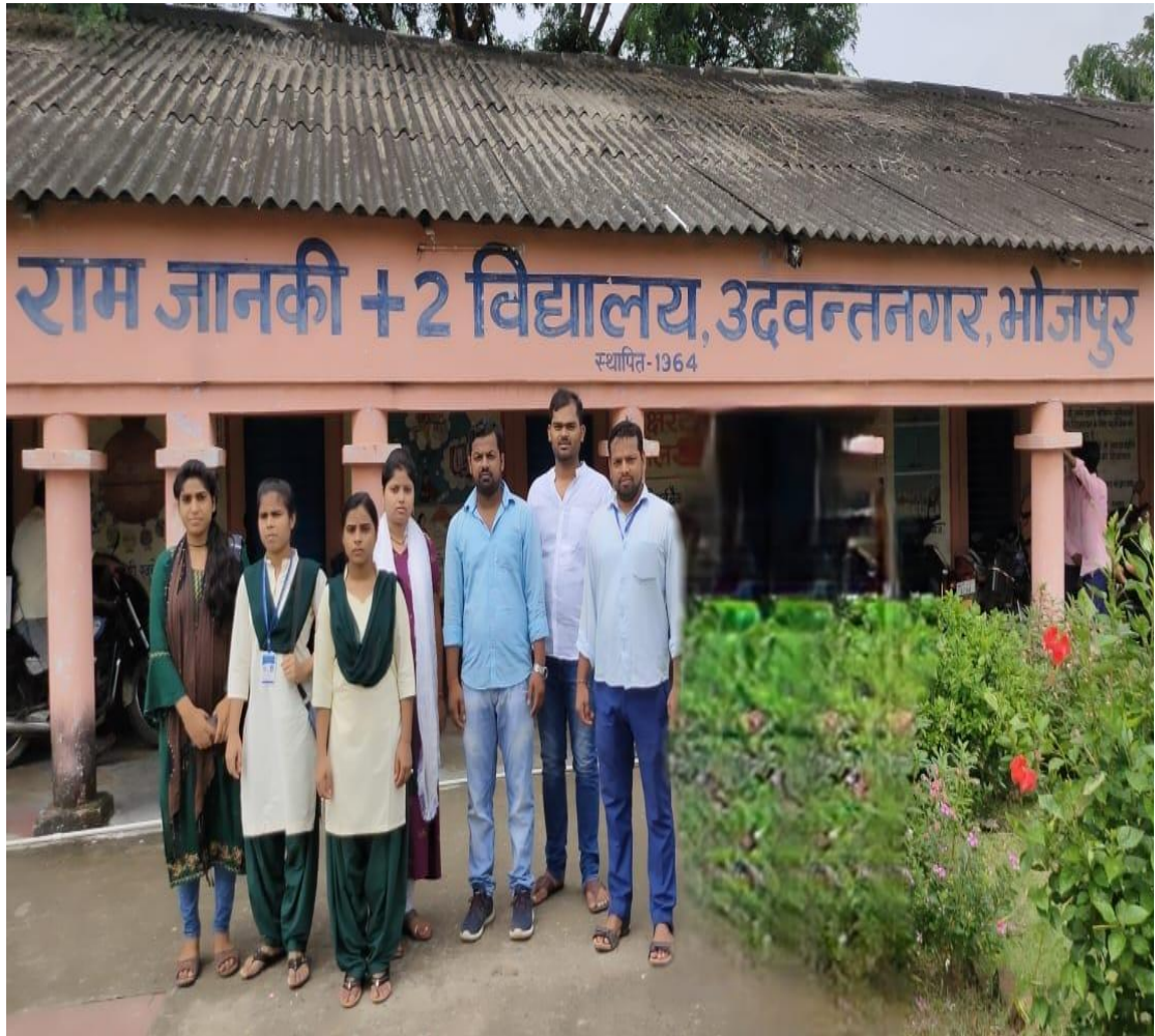
Student – Teacher Internees at High School, Udawantnagar, Ara (2020-22)