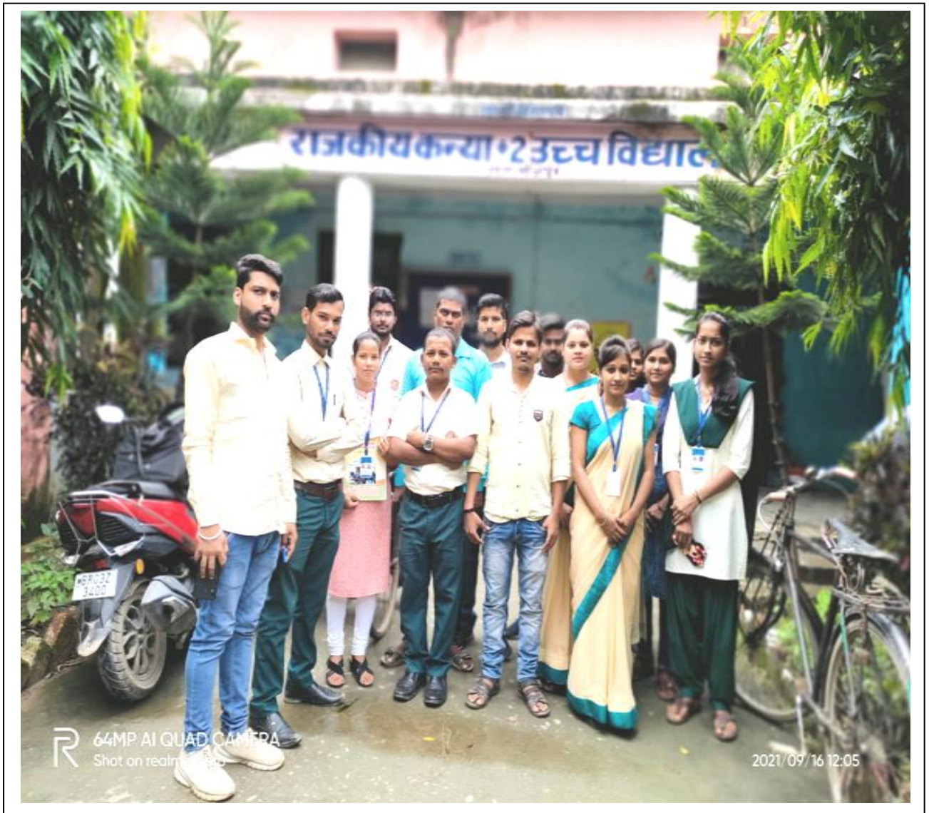
Student – Teacher Internees at Gov. Girls High School, Nawada, Ara (2020-22)