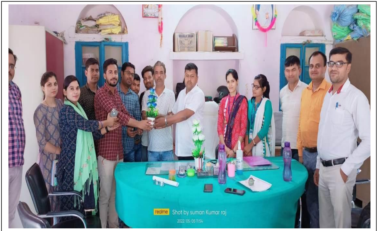
Student – Teacher Internees at Swarth Sahu High School, Jagdishpur ,Ara (Bhojpur) (2020- 22)