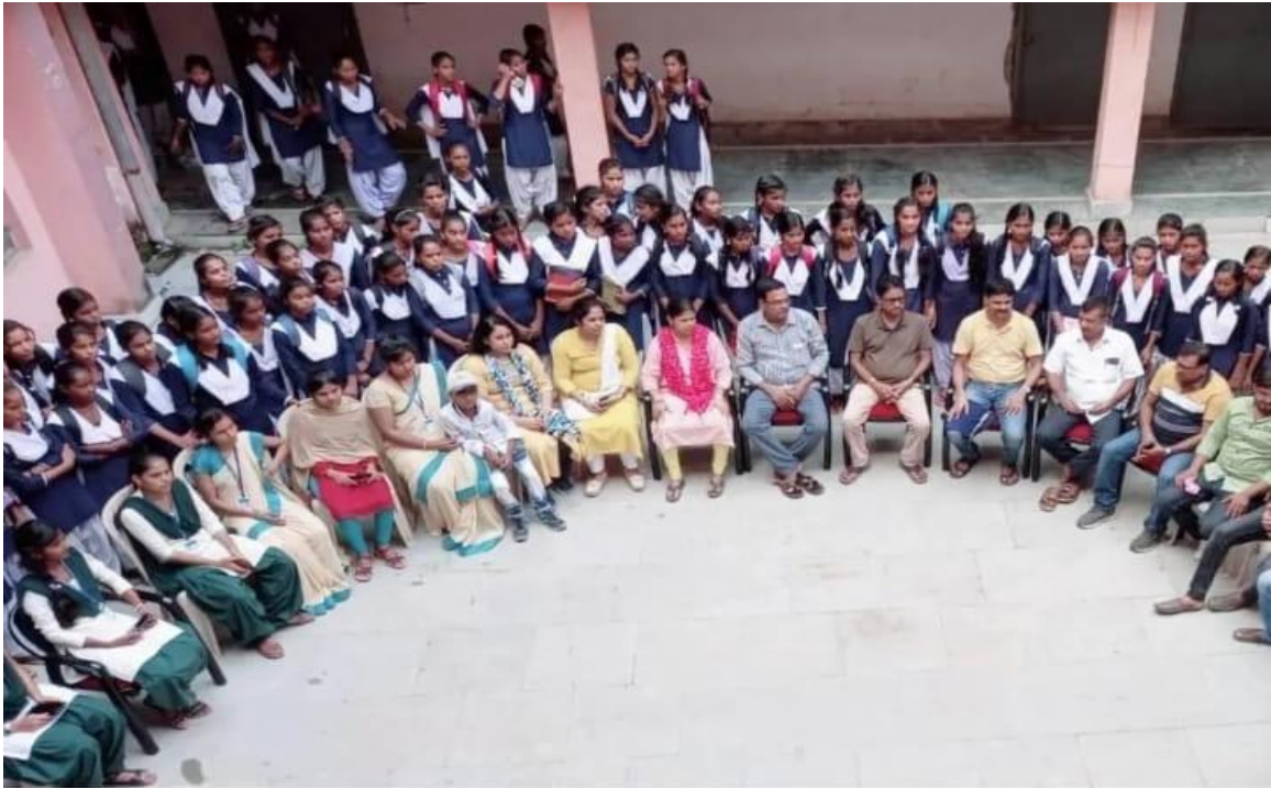
Student – Teacher Internees at S.S.R.G. +2 High School, Harigaon (2020-22)