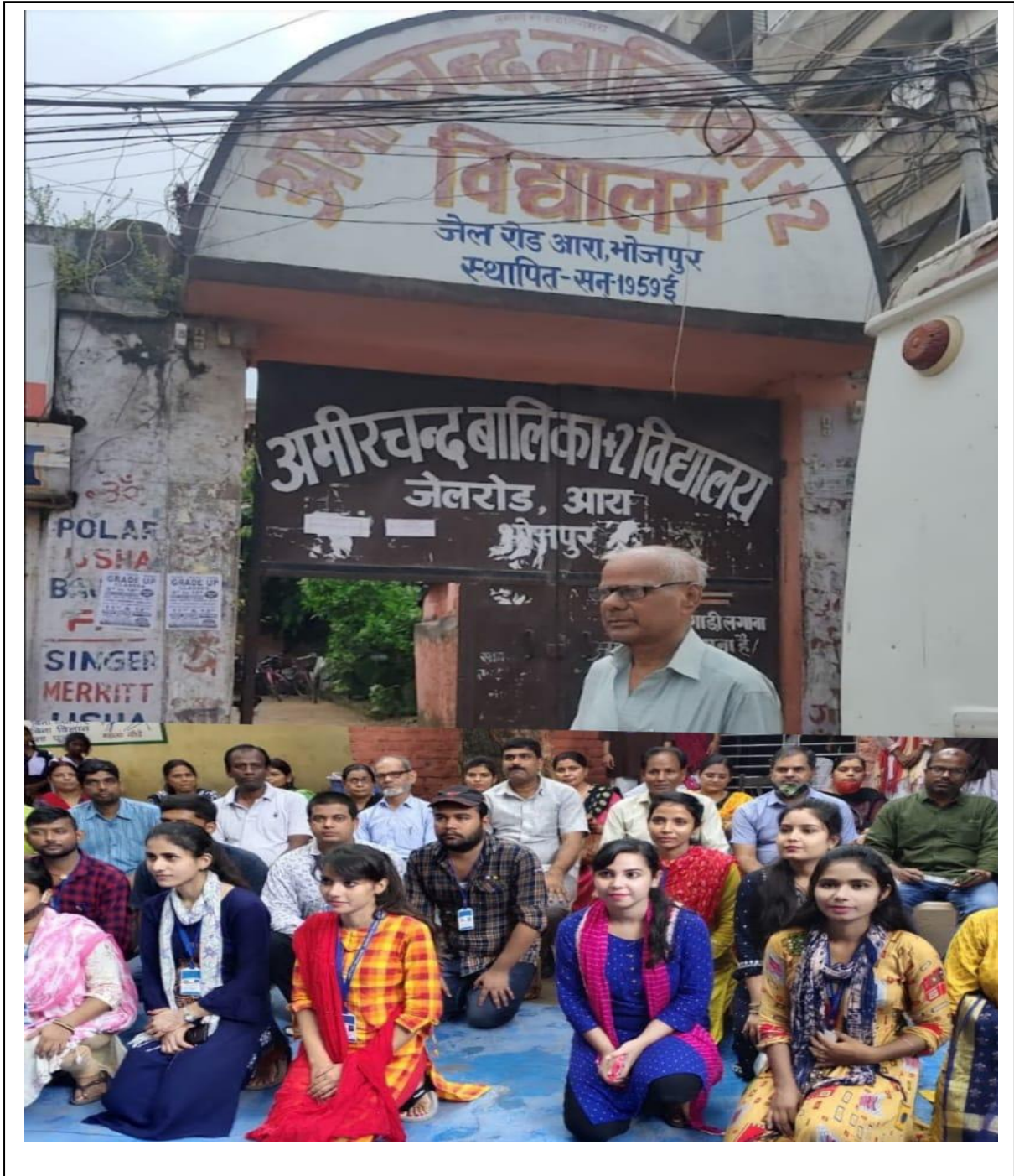
Student – Teacher Internees at Amirchand High School, Ara (2020-22)