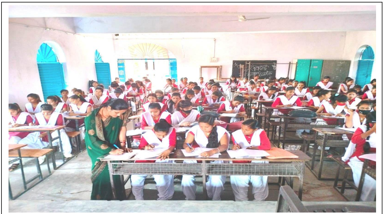
Student – Teacher Internees at Girls High School, Asani, Ara (Bhojpur) (2020- 22)