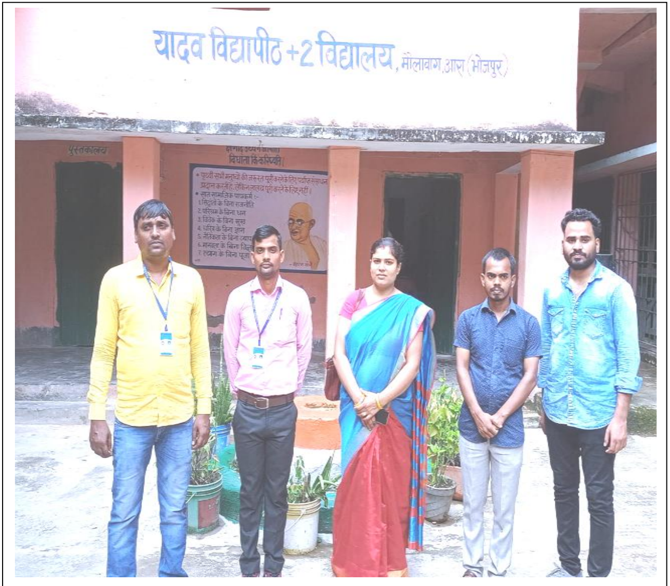
Student – Teacher Internees at Yadav Vidyapith +2 High School, Maulabagh, Ara (Bhojpur) (2020-22)