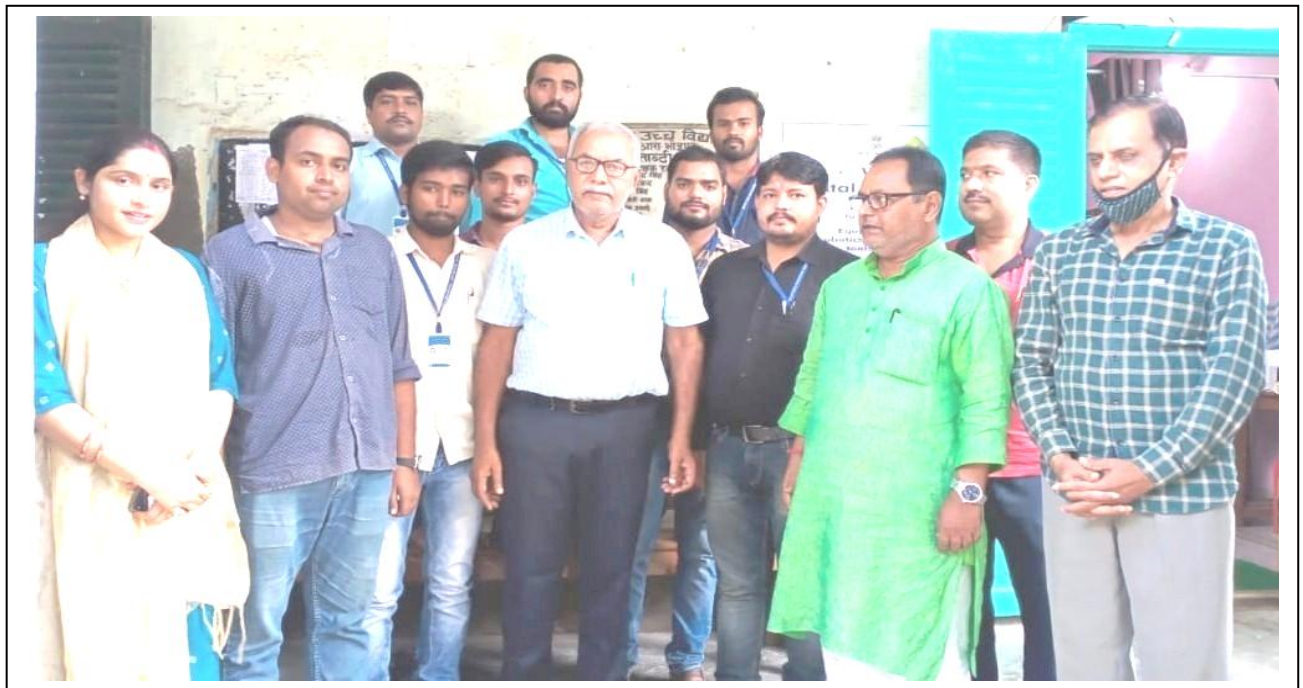
Student – Teacher Internees at Town High School, Ara (2020-22)