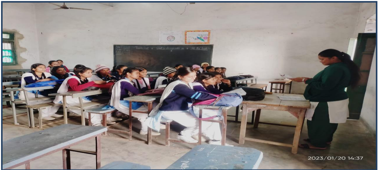
Teaching in actual classroom