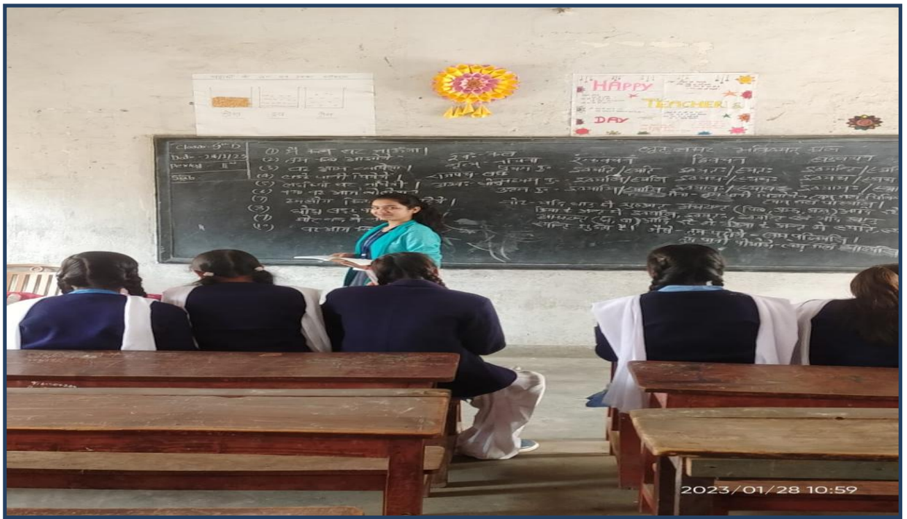
B.Ed. Practice teaching in schools