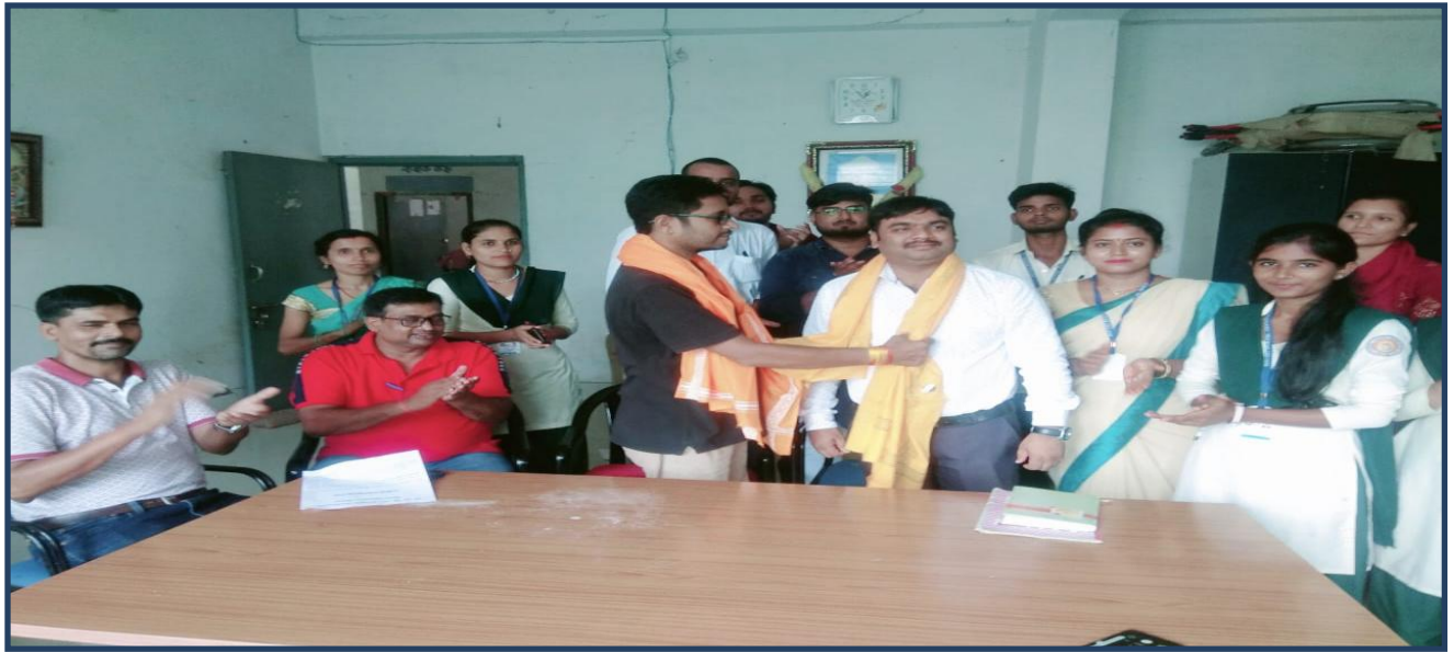
Internship in TEIs