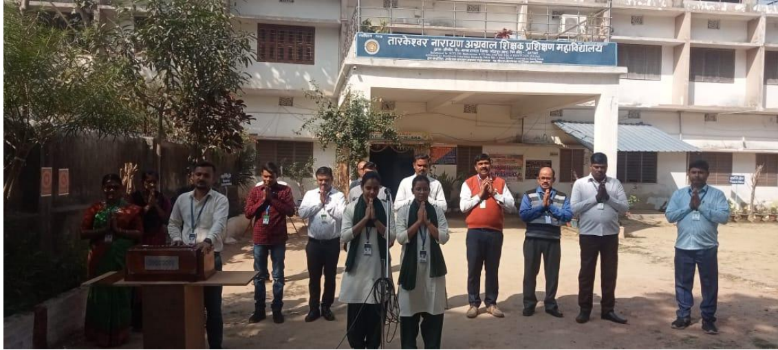
Assembly conducted by the students