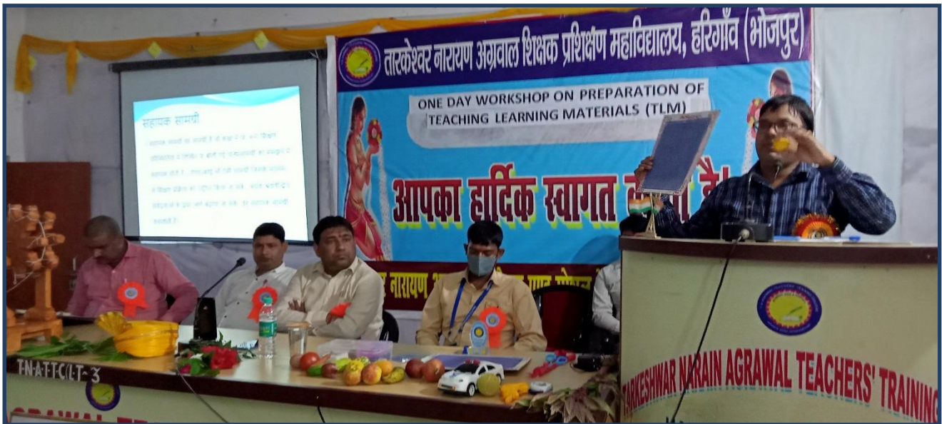
Workshop on Teaching Aids 2021