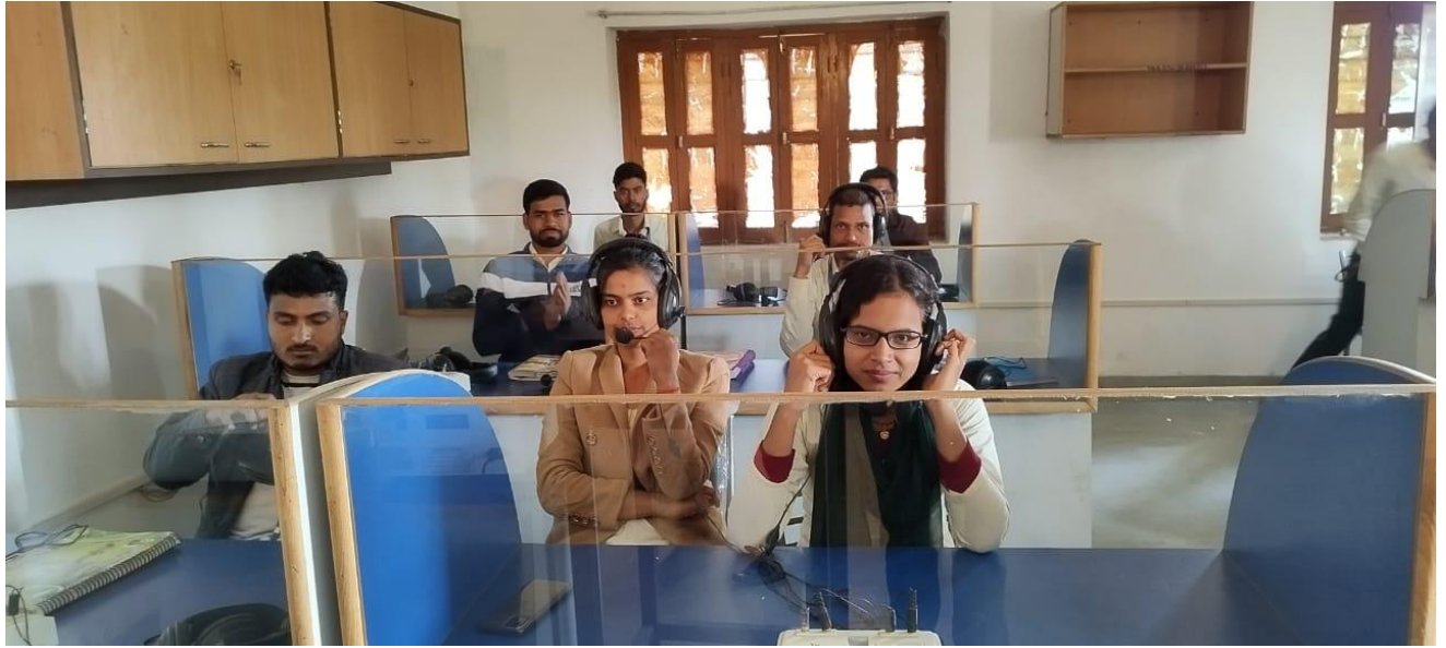
Practical Session on Language Proficiency at Language Lab Date: 08/05/2019