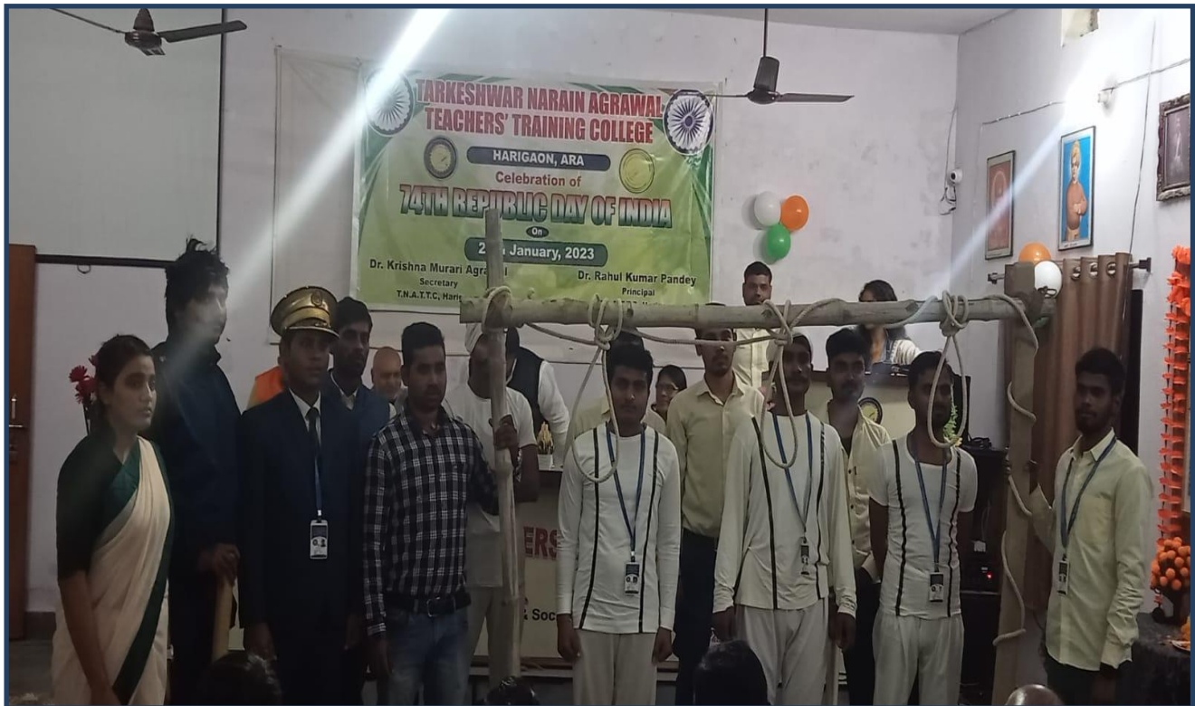
Drama and art