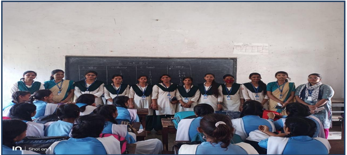
Internship in TEIs