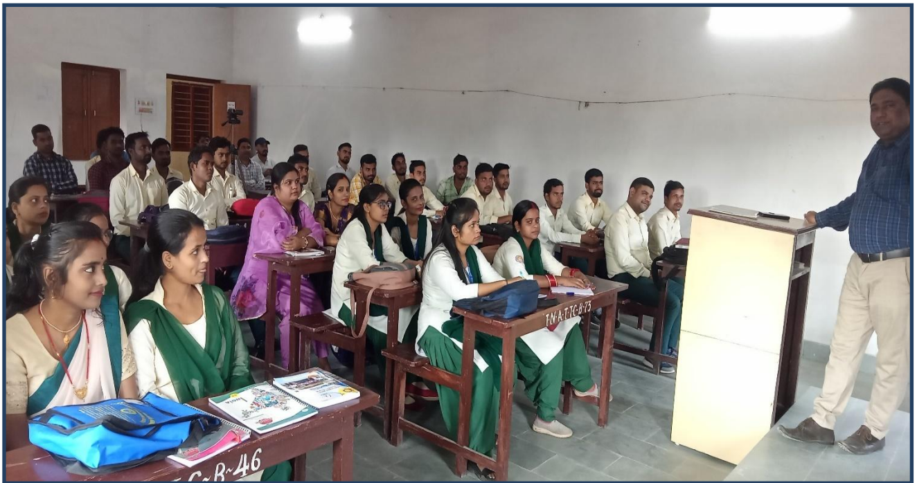
Micro teaching workshop