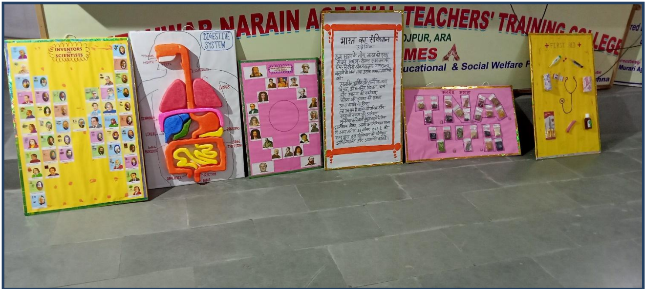
Workshop on Teaching Aids 2021