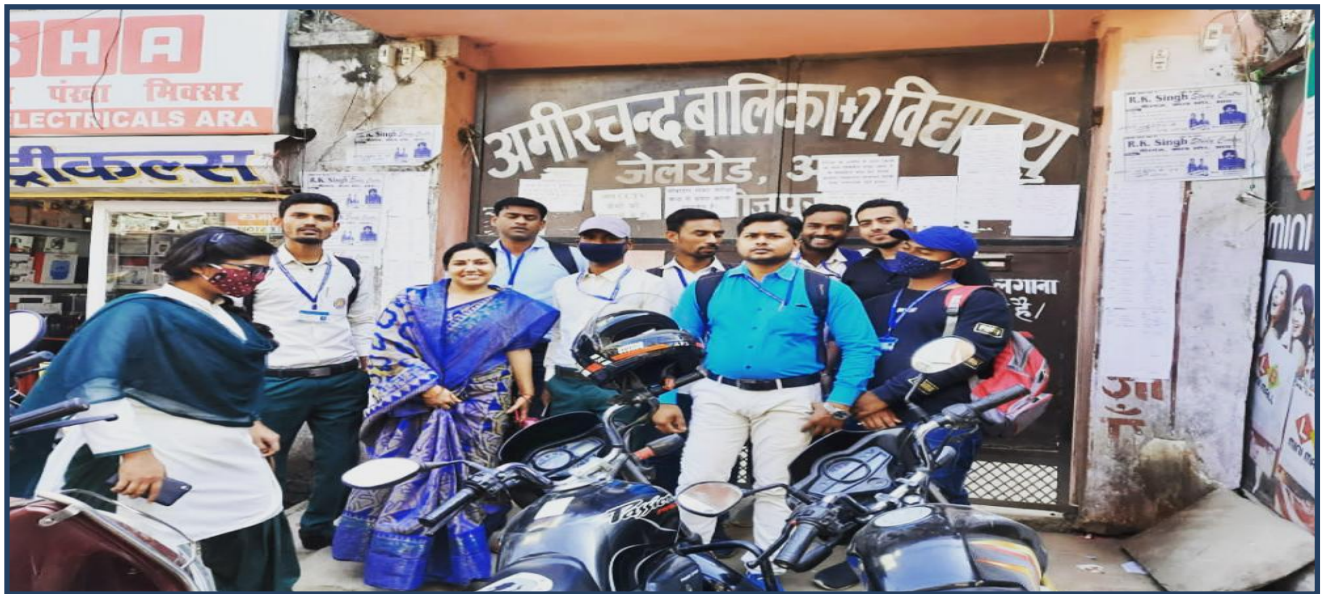
Internship in TEIs