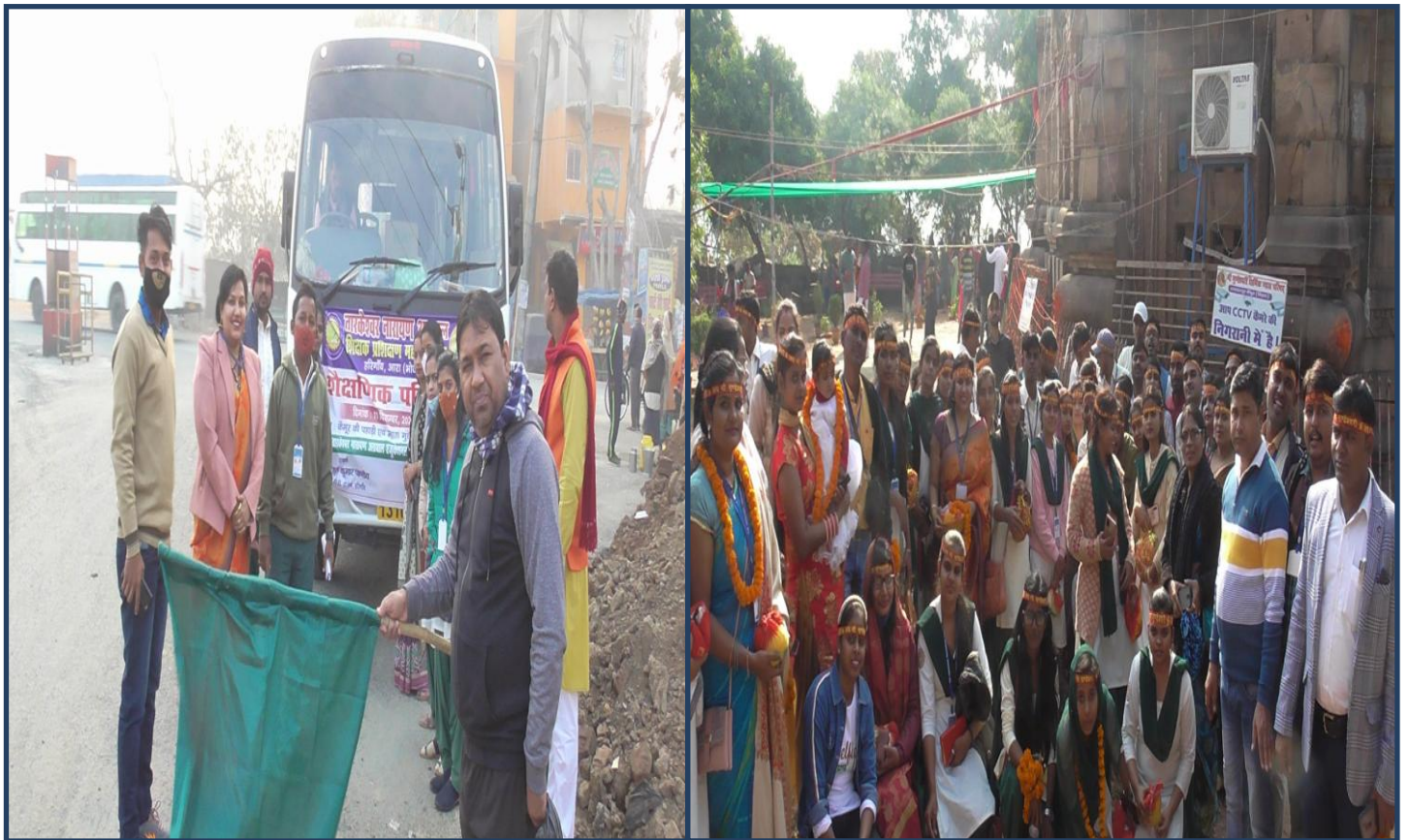
Field visit to TEIs