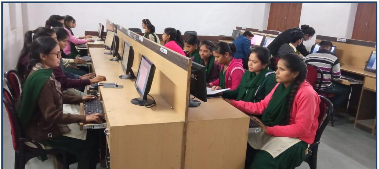
Capacity enhancement Computer Lab