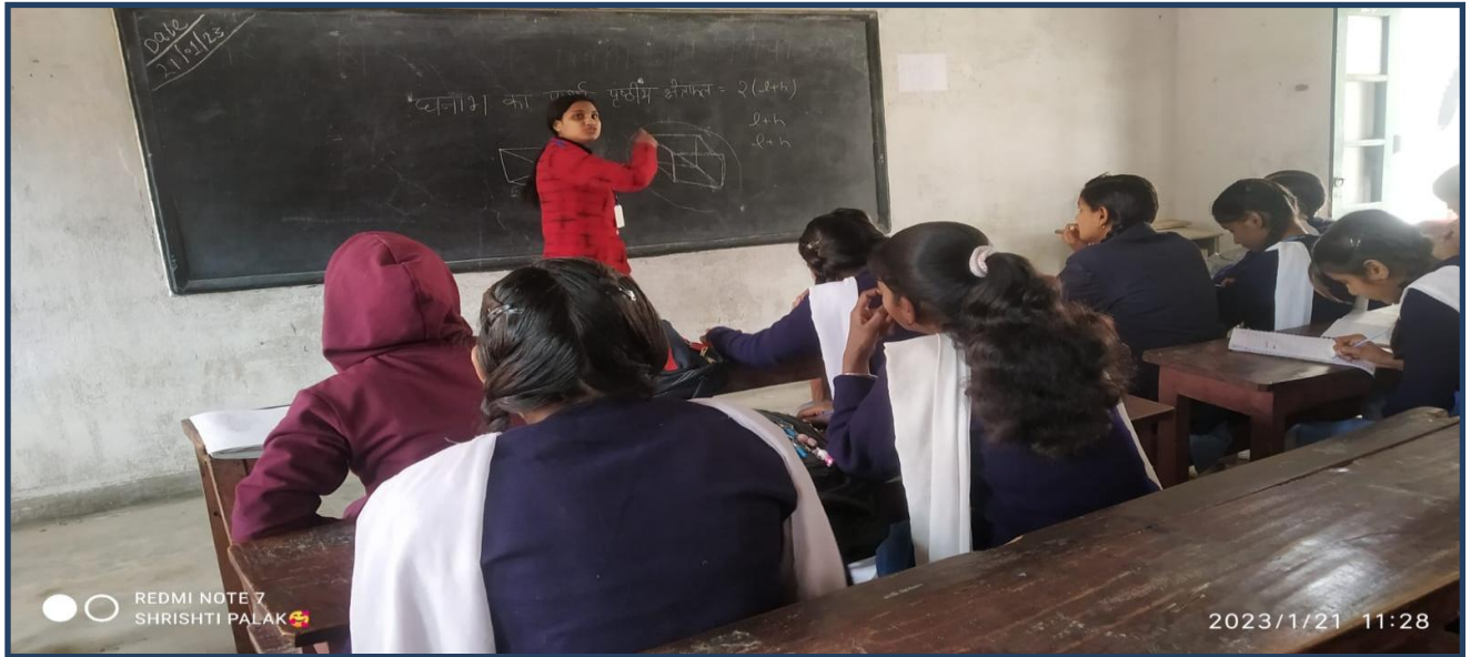
Teaching in actual classroom