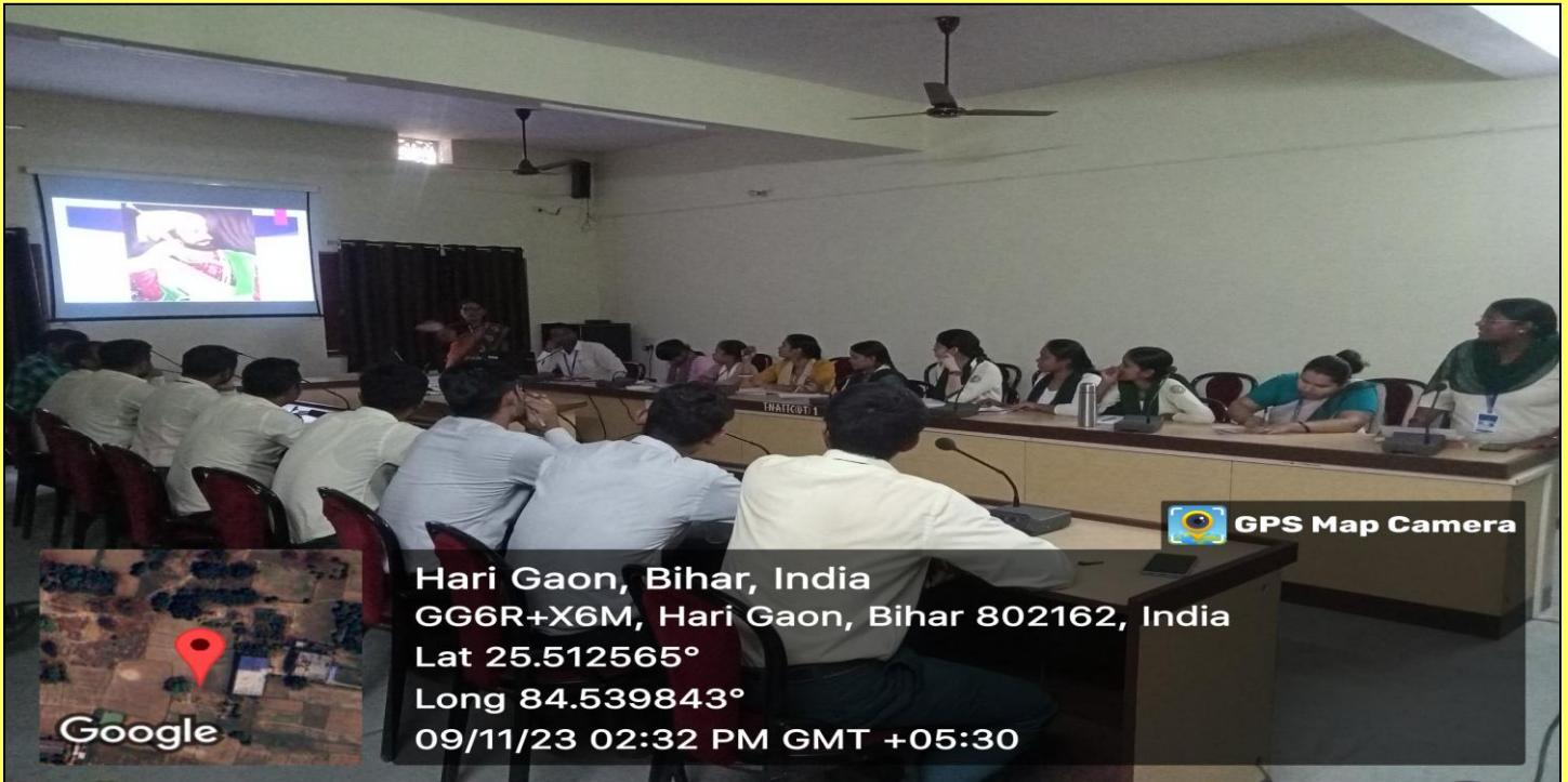
Photo Recognized by Students