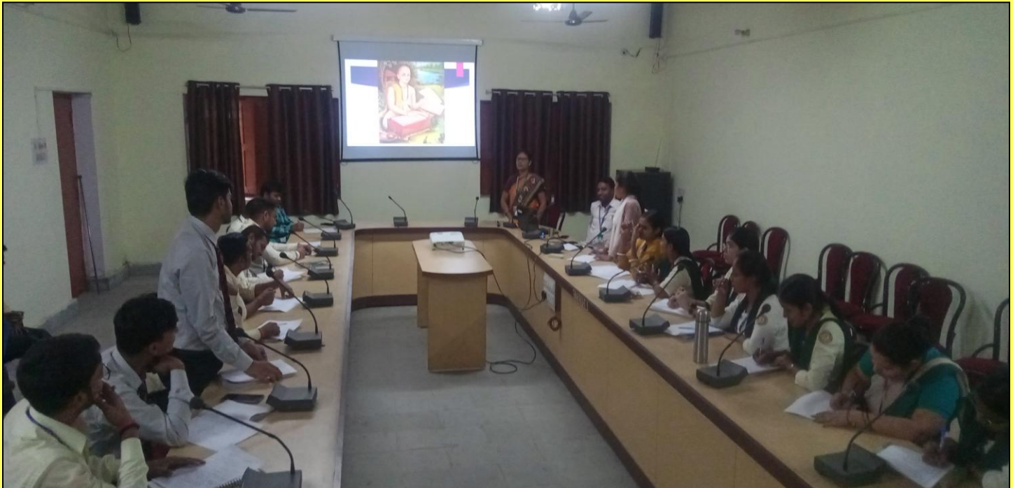
Conversation of Photo Recognition by Students & Teacher