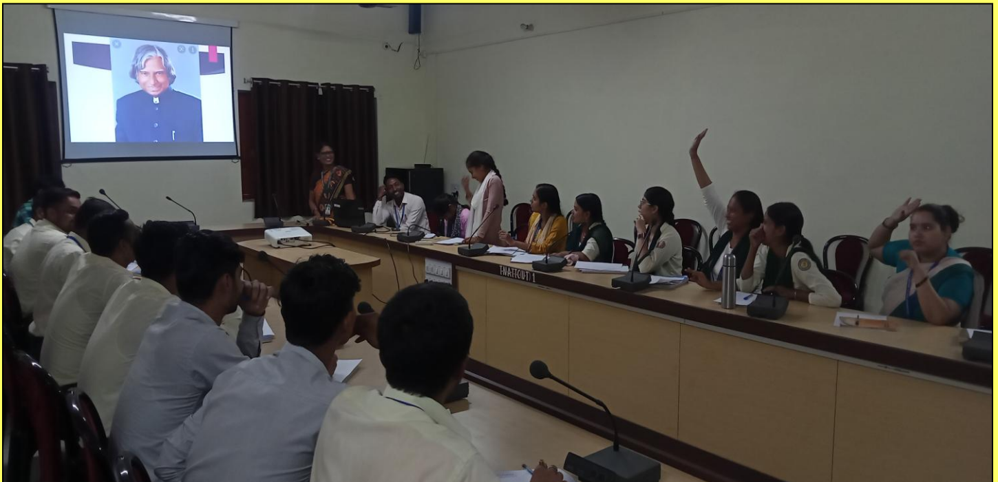
Photo Recognized by Students